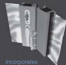
Incorporates multi-point locking for added security.

Designed and tested to comply with Australian Standard AS2047.